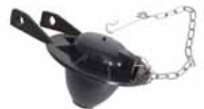
5173 (pre 2010)